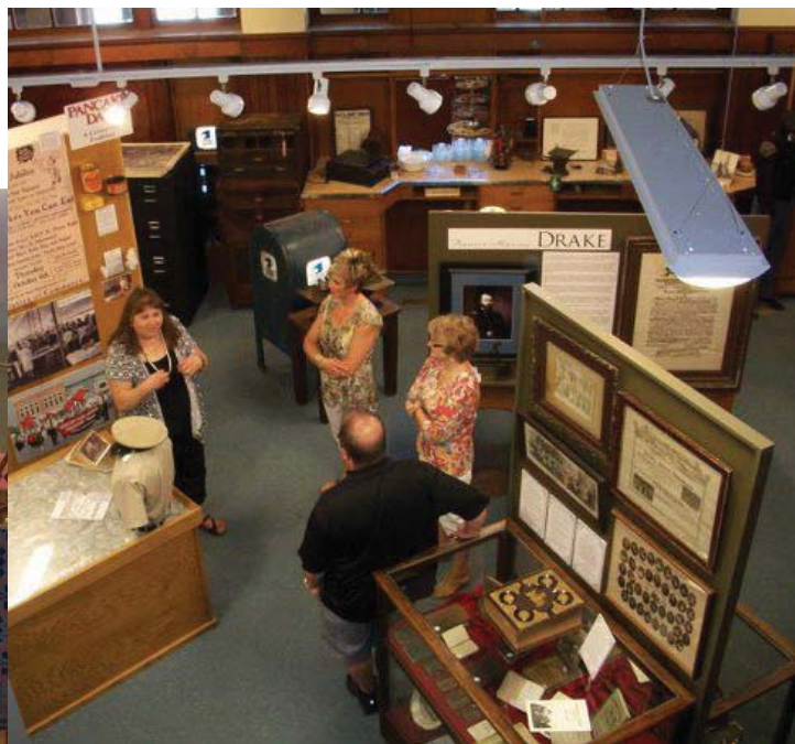
Grand Opening