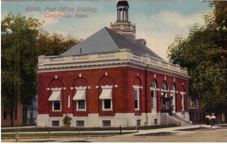
6999. Post Office Building, Centerville, Iowa.